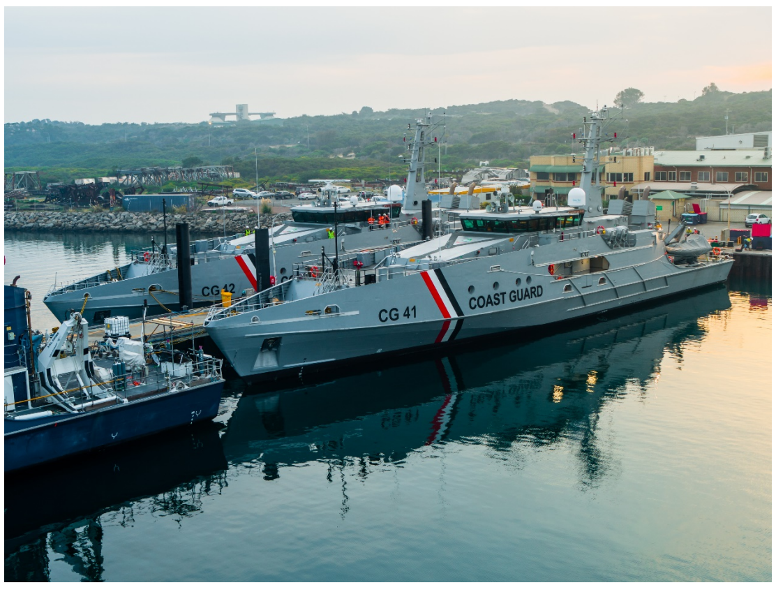
TTS Port of Spain (CG41) and TTS Scarborough (CG42) at the Austal Australia shipyard in Henderson, Western Australia