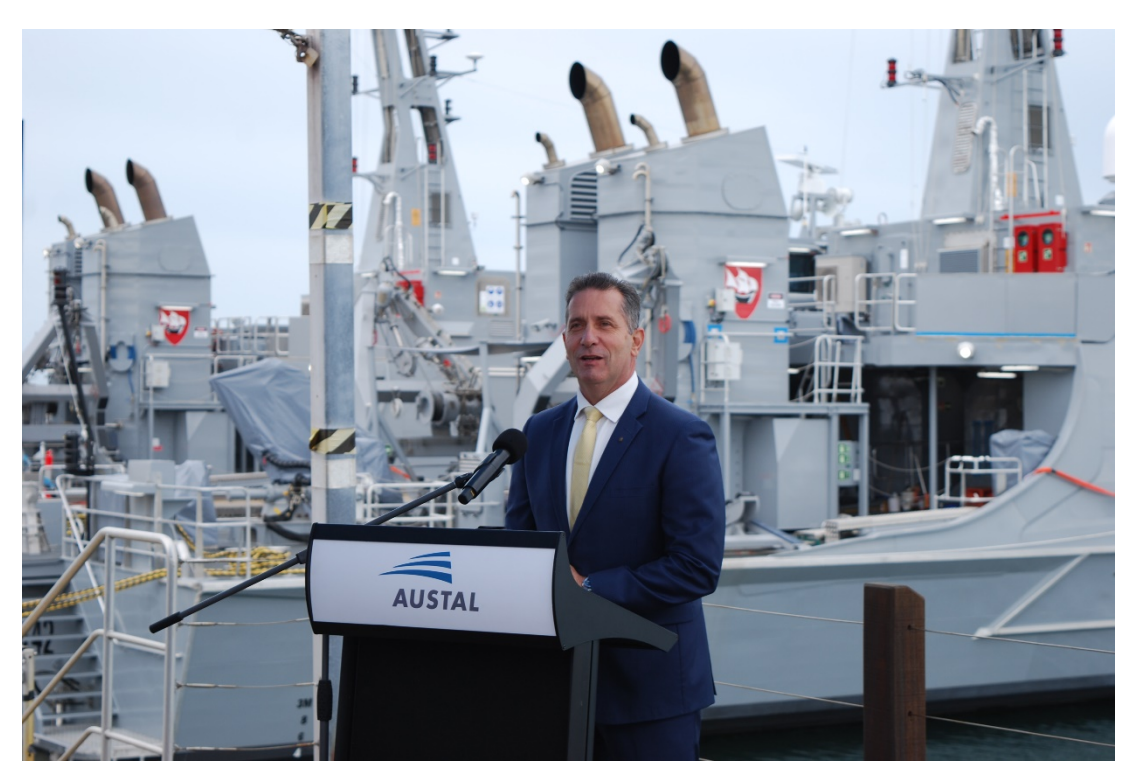
The Hon Paul Papalia CSC MLA, West Australian Minister for Police; Road Safety; Defence Industry; Veterans Issues speaking at the handover ceremony for the two Cape-class Patrol Boats for the Trinidad and Tobago Coast Guard