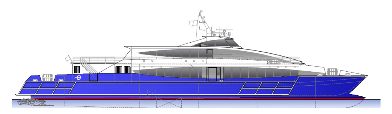
The 50m high speed catamaran to be built by Austal Philippines for Seaspovill. (Design: Incat Crowther)

The new 50 metre high speed catamaran will be constructed by Austal Philippines in Balamban, Cebu with delivery anticipated in June 2017.