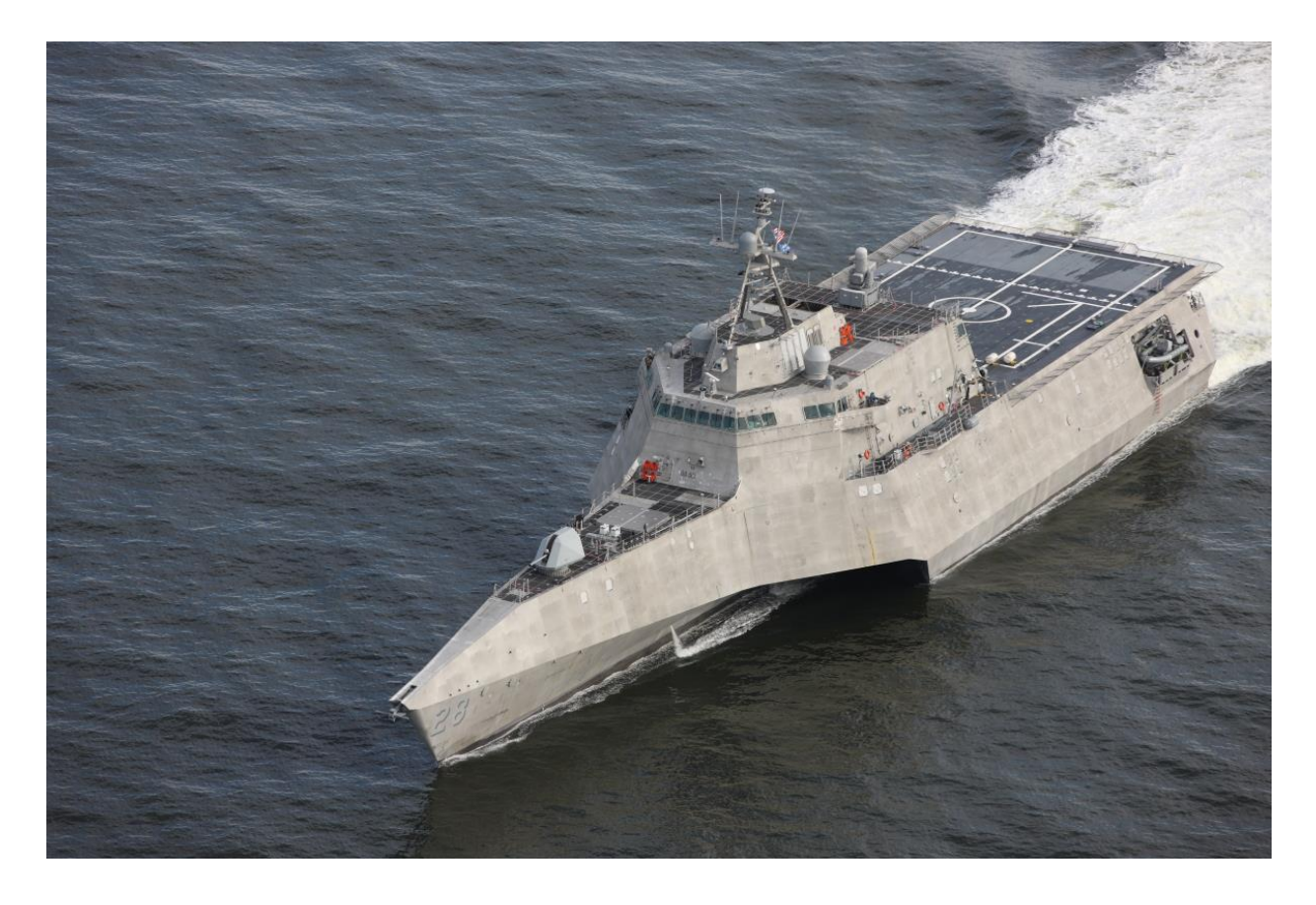
Independence-class Littoral Combat Ship, the future USS Savannah (LCS28) constructed by Austal USA has successfully completed acceptance trials