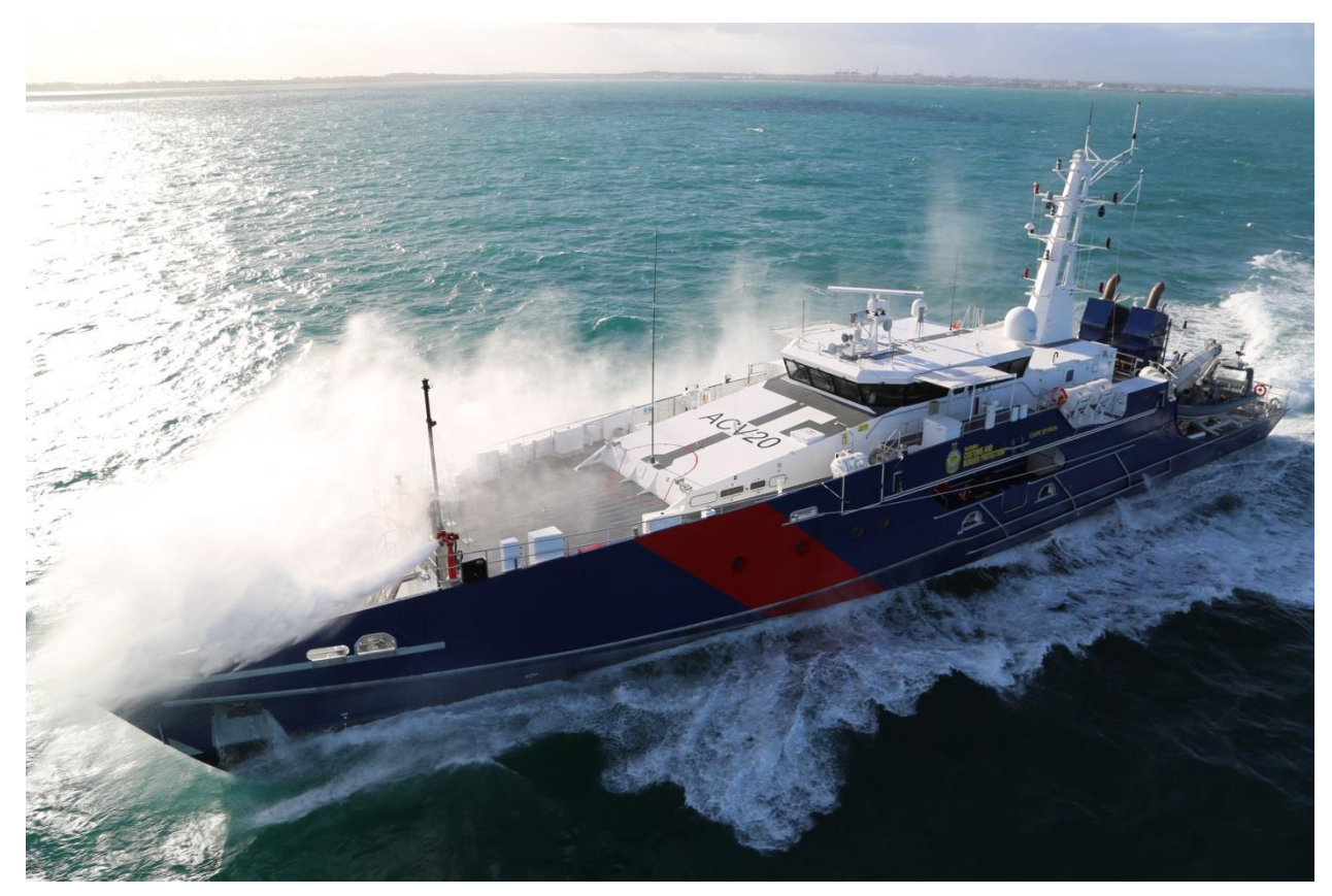
Cape Class Patrol Boat - Cape Byron